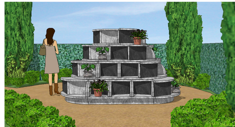
Ensemble de 40 cases